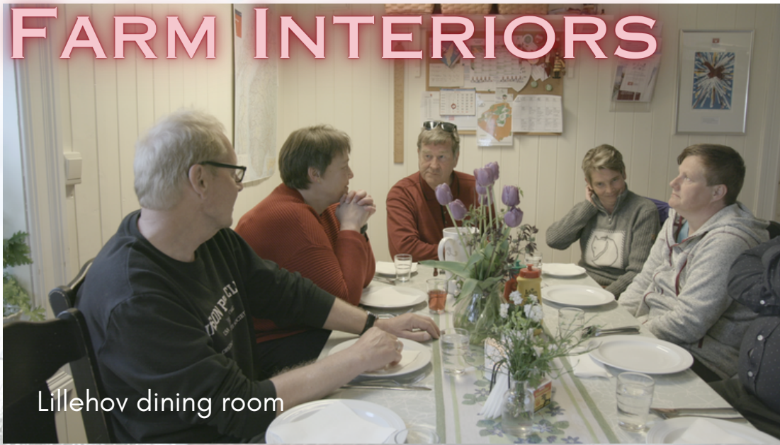
Lillehov dining room